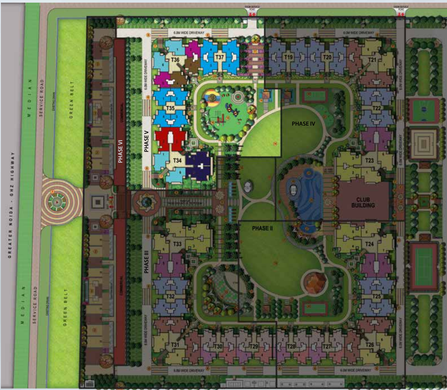
Note: The facilities & amenities mentioned above are part of different phase/project in total project, and will be available for use after development of respective phase/project.

All specifications, designs, layout, images, conditions are only indicative and some of these can be changed at the discretion of the builder/architect/authority. These are purely conceptual and constitute no legal offerings. 1sqm = 10.764 sq. ft.